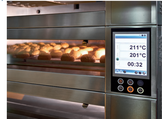
Application example: MultiTHERM® 550 in the smallest space in industrial ovens