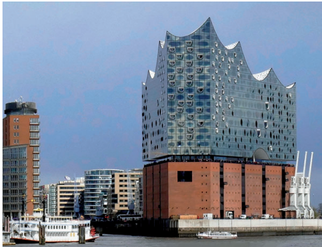
Elbphilharmonie, Hamburg / THERMAX® fire protection ceiling construction