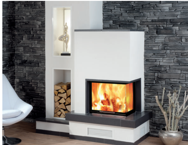
Application example: Fireplace enclosure with THERMAX® construction boards