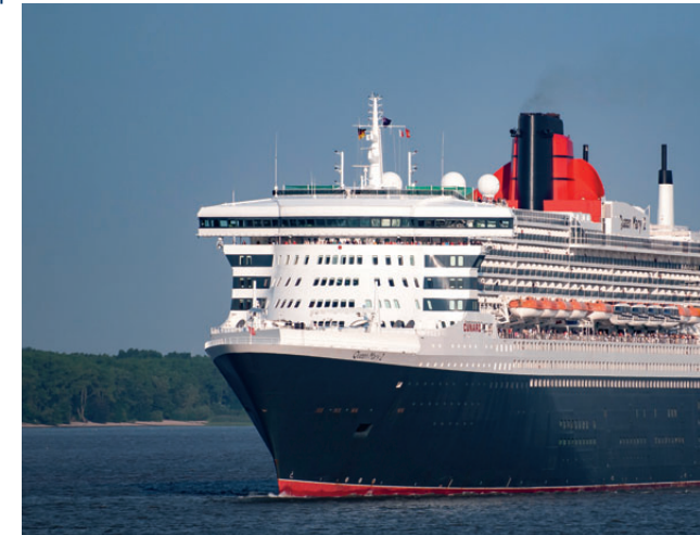
Queen Mary II / FIPRO® decorative fire protection